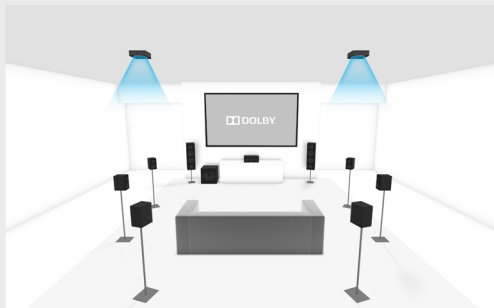
Perspective detail for 9.1.2 setup

This refers to how many overhead or Dolby Atmos enabled speakers you can use in your Dolby Atmos capable setup.